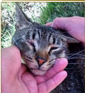
Acute Veterinary Care

What better way is there for us to show our love of cats than this?