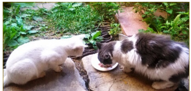
Community Cat Outreach