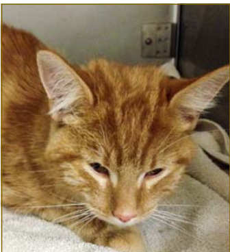
Veterinary Care Vouchers

If you are one of our participating clinics you have our sincere admiration — the community service you're providing is monumental. If you aren't a participating clinic and would like to become one, visit our web site or call us for full information.