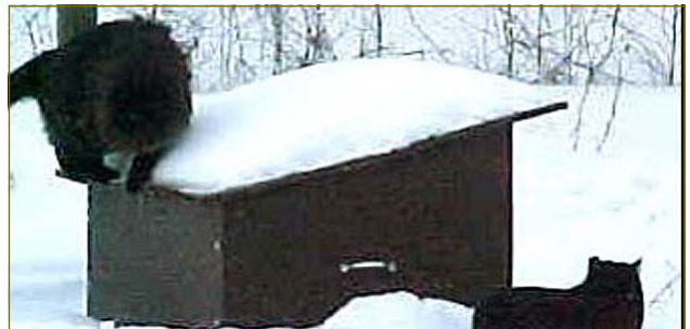
Community Cat Outreach