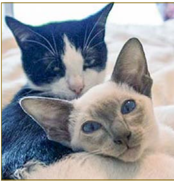
Low-Income Spay/Neuter Vouchers