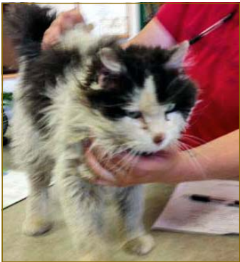
Veterinary Care Vouchers

tration) to the list of optional voucher services we can provide at time of sterilization. A few years ago we added FVRCP vaccinations and treatment for visible parasites and the response from individual clinics has been good. It's nice to see these low-income pet cats get full services when they are fixed.