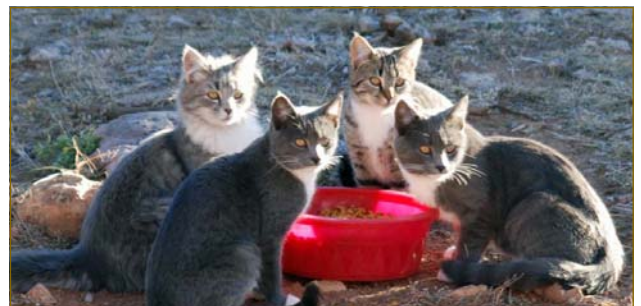
Community Cat Outreach