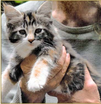
Low-Income Spay/Neuter Vouchers